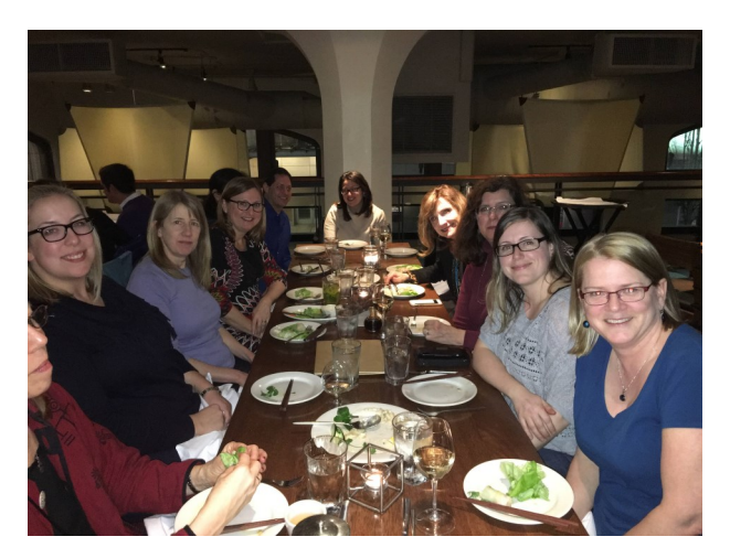
More mentee dinner